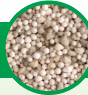
SUPERIOR AMMO 31 N 31 | S 14.4

Superior Boost provides the key nutrients N, P, K, S (nitrogen, phosphorus, potassium and sulphur). It can be used in a range of situations – for boosting pasture growth after silage removal, starter fertiliser, crop establishment and a general pasture application.