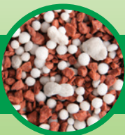
SUPERIOR NKS N 24.3 | K 20 | S 3.1

Superior Ammo 31 is a 60:40 blended mix of ammonium sulphate and urea. Superior Ammo 31 can be used in late winter/early spring applications, boosting pasture production and lifting nitrogen and sulphate levels in pasture for the spring growth