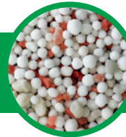
SUPERIOR AS-K N 38.6 | K 2.5 | S 4.7

Superior has specially developed Superior 20 to provide you with a higher ratio of N to P, and essential S where K is not required. Superior 20 is suitable for drilling field crops, cropping, broadcasting greenfeed brassicas and for sheep, beef and dairy pastures.