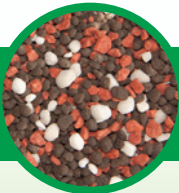
SUPERIOR BOOST N 14 | P 12 | K 12 | S 3.6

Superior AS-K is a ready-to-use urea-based blend to provide you with a high N content and additional K and S. It can be used for most crops, including as a second or late N application to brassicas (applied with caution due to sulphur content – consult your Superior Field Consultant).