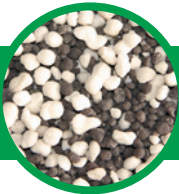
SUPERIOR 20 N 20 | P 9 | S 13

In addition to producing specialised custom blending, Superior recognises that there are some situations where an off-the-shelf product is perfect for the job. That's why Superior has developed a product range for all situations to be used as starter fertilisers, post-balage cuts and for spring and autumn applications.