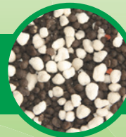
SUPERIOR DAP+S N 18.5 | P 16 | S 4.8

Superior NKS is a ready-to-use blend that will provide you with a good balance of N, K and S. Designed specifically for fodder beet, it can be used for first and second N and K applications.